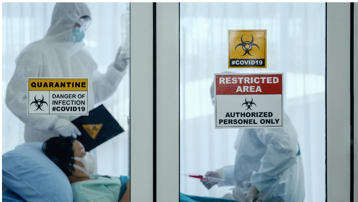
Two healthcare personnel attending to a COVID-19 patient.

Native employment rate has always been lower than other demographics in the United States and a vast majority of employed Natives belong to the leisure and hospitality industry. Due to the pandemic's protective measures and travel restrictions, people working in this industry (and others) are left without work, increasing the overall unemployment rate of the Native Californians.